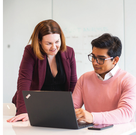
BUSINESS & COMMERCIALIZATION