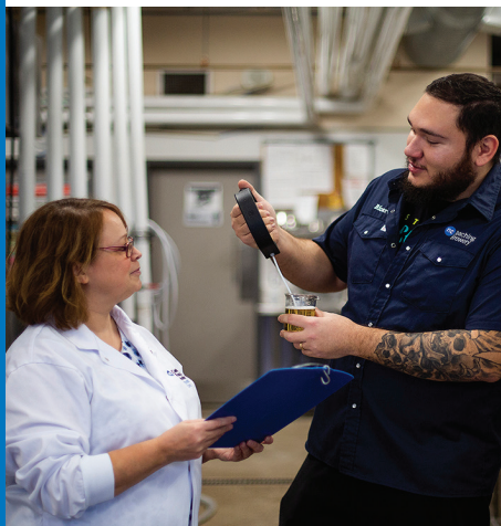
FOOD & BEVERAGE INNOVATION