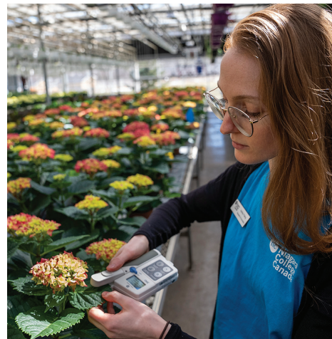
HORTICULTURE & ENVIRONMENT